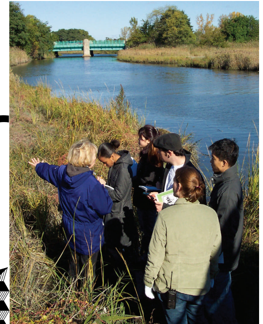
Fall Interns learning about Alley Creek.

Application letter of recommendation, completed application form (opposite side of flyer) and a 250 word statement answering one of the three questions listed on this side of the flyer. Send