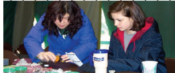
Students testing water sample for dissolved oxygen.

Our Summer Internship focuses on documenting organisms that reside in Alley Pond Park through photography and field notes to create a field guide of the area. Deadline for this internship is June 8th. (Applications will be sent out to schools in Spring).