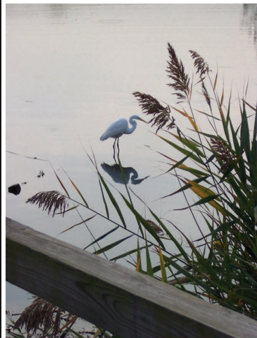
Great Egret at Alley Creek.